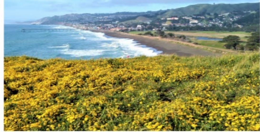
Plan Pacifica Neighborhood Visioning Meetings Summary Report July 2019